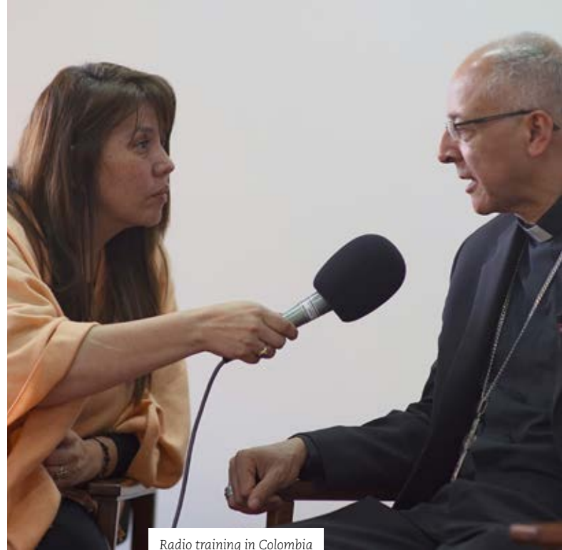
Radio training in Colombia