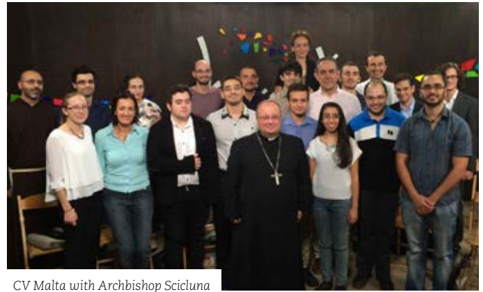
CV Malta with Archbishop Scicluna