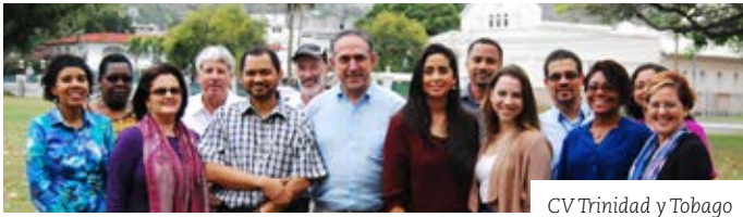
CV Trinidad y Tobago