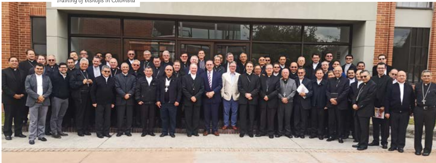
Training of bishops in Colombia

Through the Catholic Voices Academy, we offer regular briefings to both journalists and speakers on topics in the news or forthcoming events such as papal trips. CV in Mexico organized day-long seminars for journalists in advance of the trips by Pope Benedict in 2012 and Pope Francis in 2016. We also host public lectures on major topics by visiting speakers.