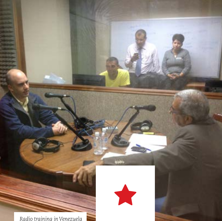
Radio training in Venezuela