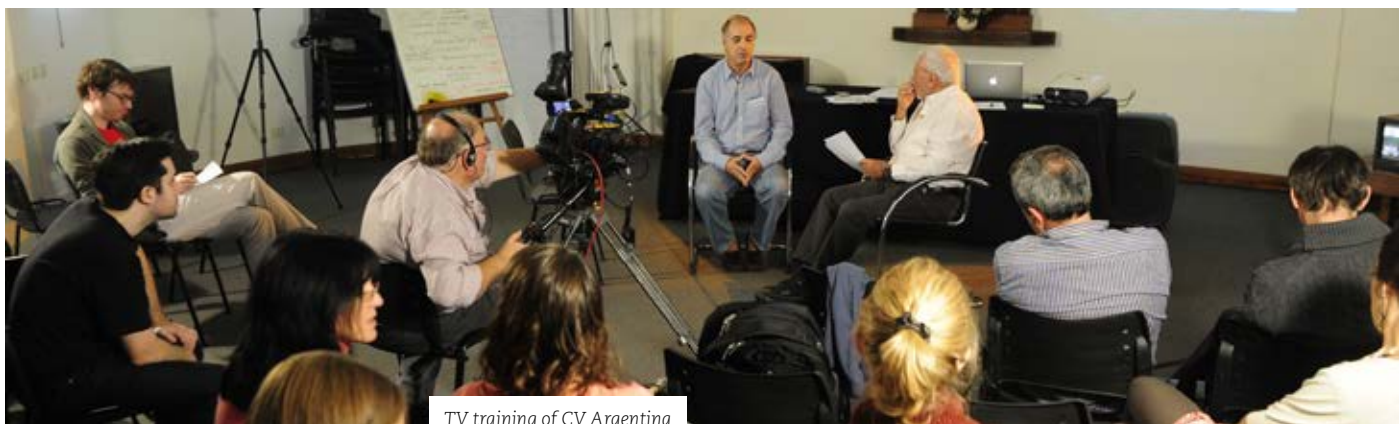
TV training of CV Argentina