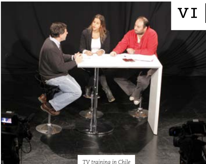
TV training in Chile

Our CVcomment.org blog has become a go-to source for authoritative comment on breaking news stories, especially those related to the Vatican and Pope Francis. More than 6,000 people receive email updates every time we post, equipping Catholics with background information and talking points on breaking news stories.