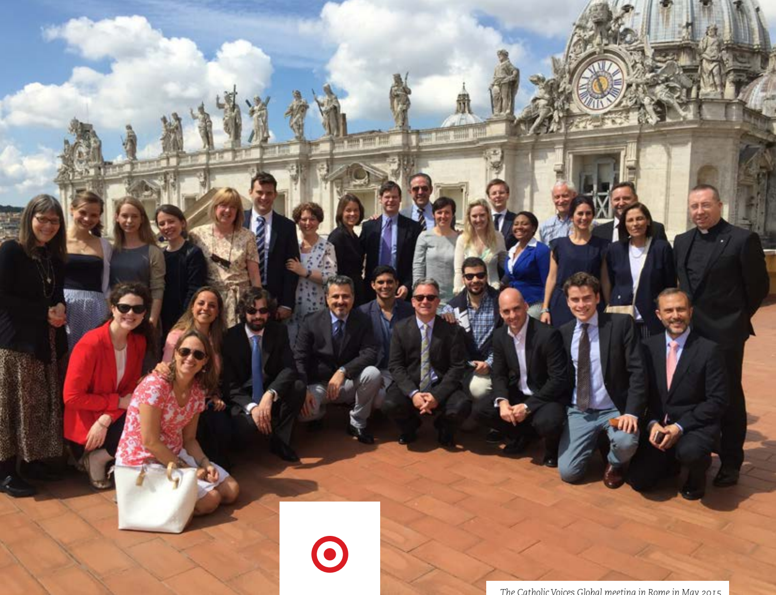
The Catholic Voices Global meeting in Rome in May 2015 brought together people from 20 countries