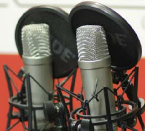
TV in Bolivia